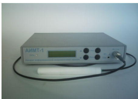
Fig. 2. The device of information microwave therapy

The most perspective of them at practical use in National Health Service and in everyday life are autonomous (Fig. 2) and IBM compatible (Fig. 3) hardware and software for recovery of disturbed organism homeostasis by means of electromagnetic radiations of microwave range (range of frequencies (4,0–4,3 GHz)).