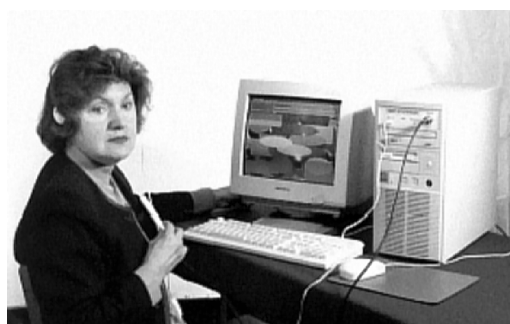
Fig. 3. The system equipment used during the medical procedure

For adequate simulation of high-frequency structure of the cosmic microwave background the hypothesis of the defining role in formation of amplitude-frequency structure of microwave radiation of the low-frequency fluctuations of a natural origin caused by processes of explosive character [12] was made.