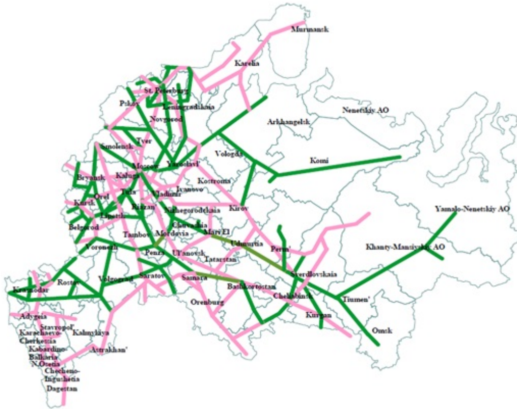
Fig. 2. JSC “Russian railways”-1 and JSC “Russian railways”-2: option dealing with the splitting of a single corporation [3]