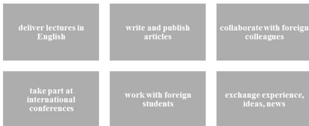
Fig. 1. Key professional tasks that require the knowledge of English

All these difficulties could easily be predicted, they are common and natural. Perhaps, coming across these difficulties means that a student is already working on them, because they are a part of a process. If a student can define a problem, he or she will soon work it out. We as teachers should develop a strategy towards solving